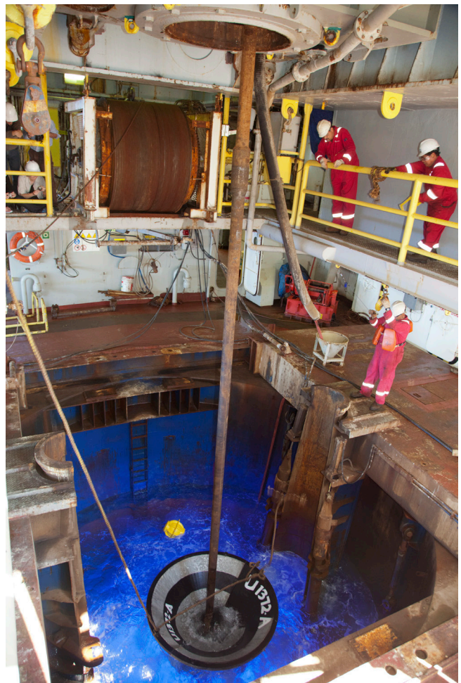
Free-Fall Funnel installed over the drill string and ready to drop in the moonpool.

The FFF is not capable of supporting a casing string. The FFF is not intended for use when reentry is considered likely during subsequent legs. If the top of the borehole is washed out or the sediments are not consolidated enough for adequate support, the FFF can occasionally sink out of sight. The FFF provides no guarantee that a collapsed borehole can be located and reentered.