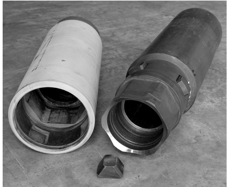
Photograph of the following MBR components: MBR Bit Disconnect, (left cylinder), Top Connector with hex drive (right cylinder), and Latch Segment (small pyramid-shape in the center).

Dropping the core bit, float valve, four latch dogs, and lower MBR leaves metal junk in the hole, which effectively prevents further drilling or coring.